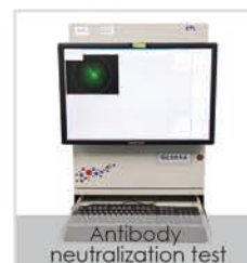
Antibody neutralization test