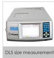
DLS size measurement