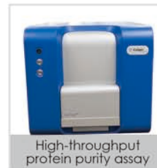
High-throughput protein purity assay