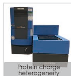
Protein charge heterogeneity